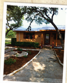
Austin/San Antonio lodging