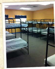
Group bunk dormitories