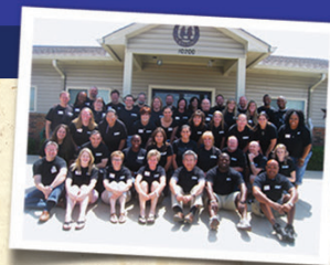
Staff members are educators

Lone Star Leadership Academy alumni are invited to participate in Education in Action's alumni organization, the Lone Star Leadership Academy Alumni Council, to continue their leadership development throughout the school year.