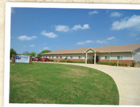
Dallas/Fort Worth lodging