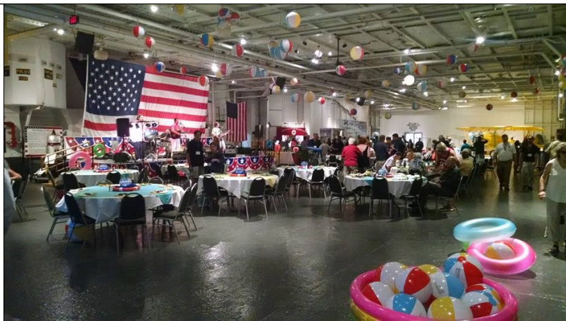
Steel Beach Party held aboard LEXINGTON provided fun diversion during the conference.